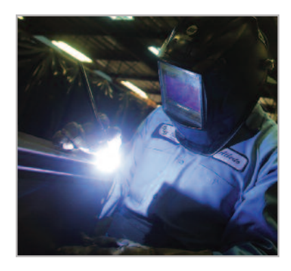
Made in the U.S.A

Made from commercial-grade 304 18-8 stainless steel, with durable heli-arc hand-welded seams.