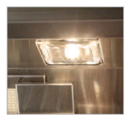
Halogen Work Light

Integrated high-intensity halogen work lights on 32" and 36" models. Light lens is easily removable without the use of tools. (Professional Series only)